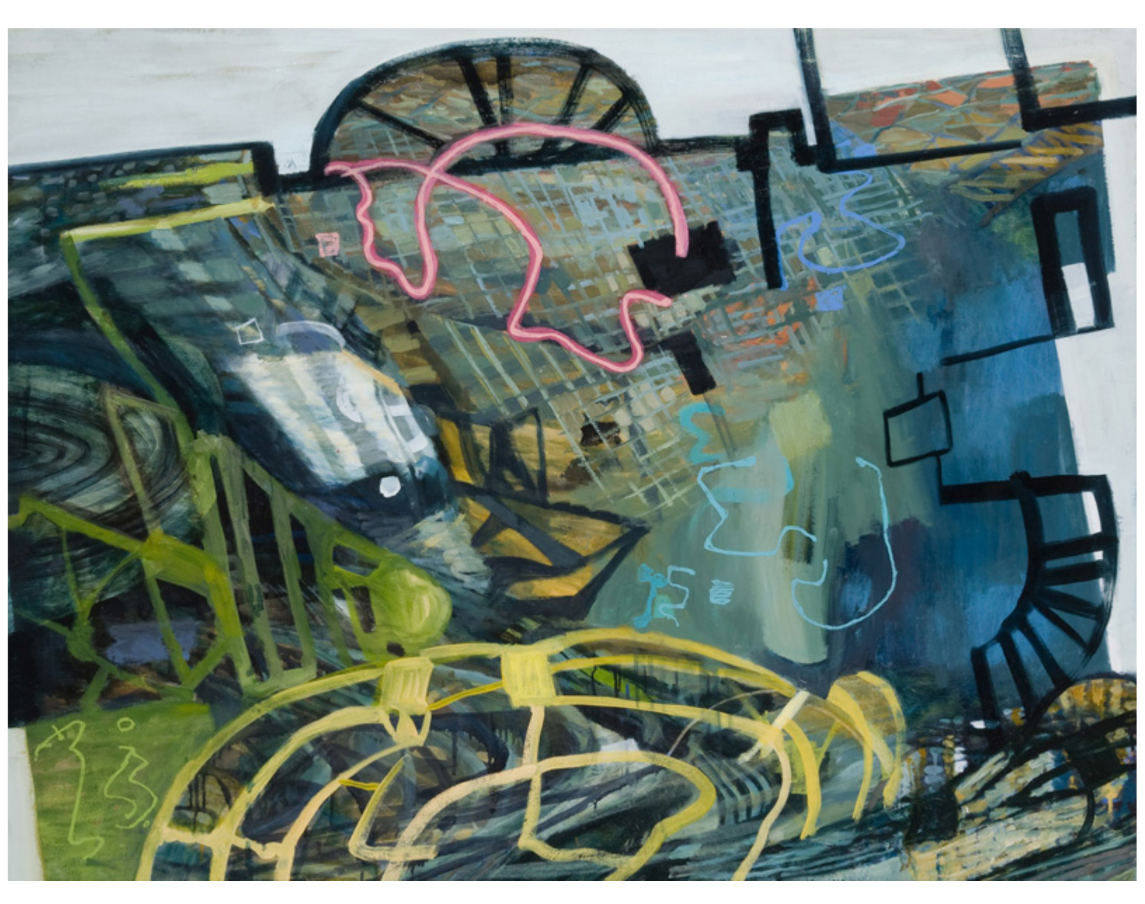
Barbara Grad, Erosion , 2008, oil on canvas, 46 x 60", Courtesy of the artist.