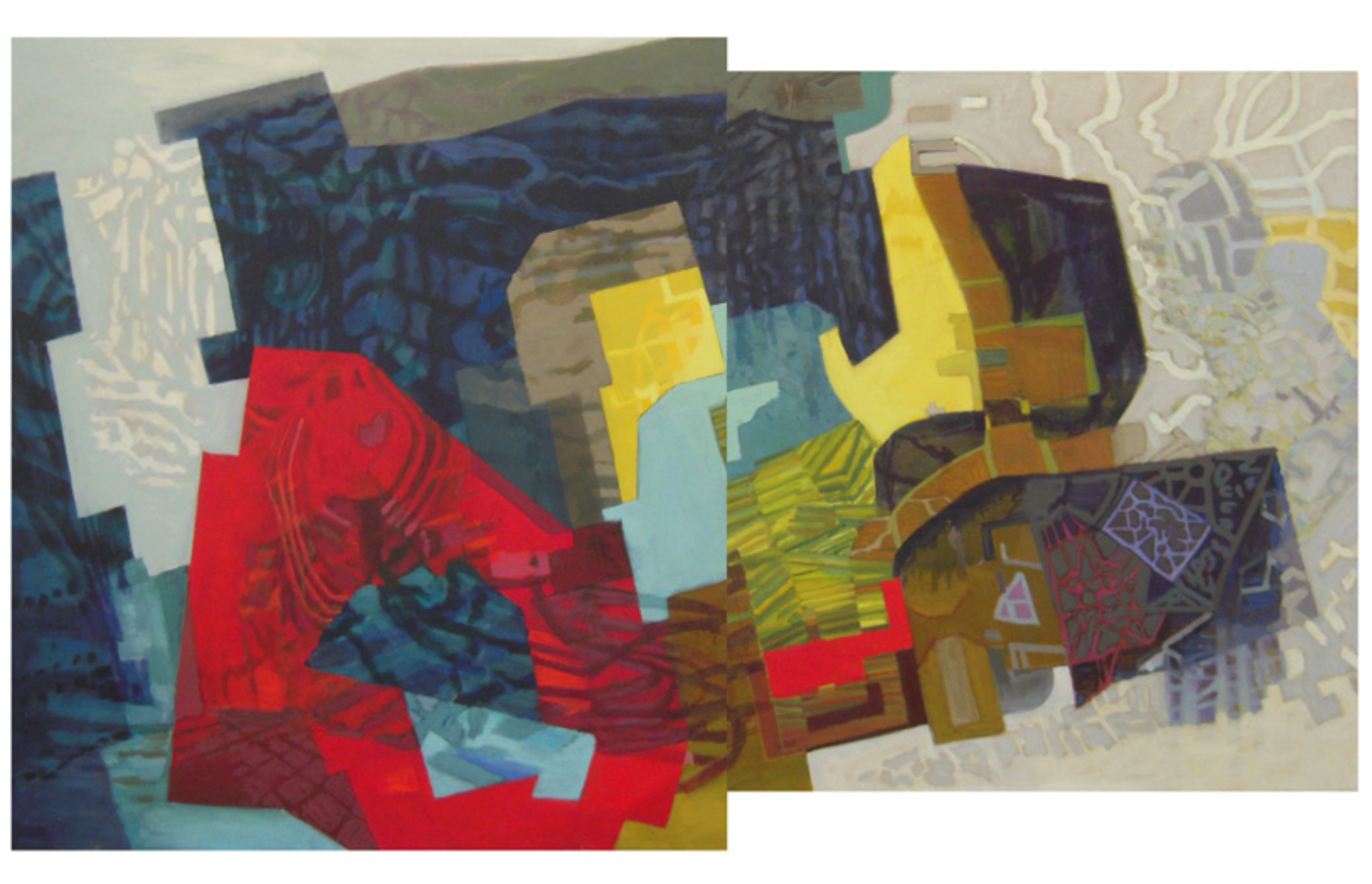
Barbara Grad, Video Villa, 2010, oil on linen, 57 x 90", Courtesy of the artist.