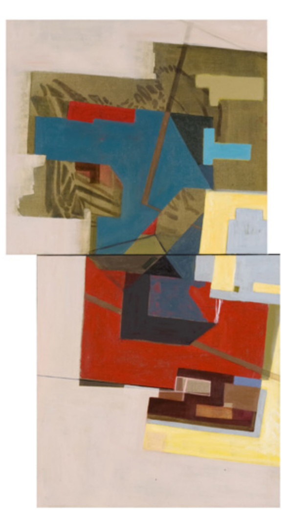
Barbara Grad, Executive Shift, 2008, oil on linen, 54 x 29", Courtesy of the artist.