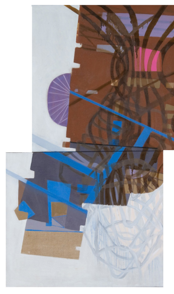
Barbara Grad, Dark Slide, 2008, oil on linen, 54 x 31", Courtesy of the artist.