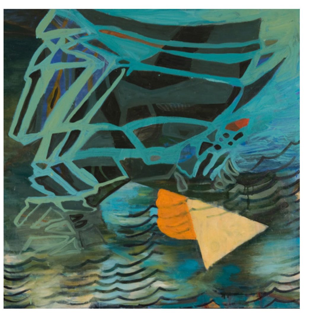
Barbara Grad, Greenspace, 2008, oil on linen, 48 x 48

paintings together are part of an illusion, but not a diptych. Deep, dark reds might be seen as a place to rest the eye, but the actual relief is seen on the second canvas, whose wider bands of color and looser texture are much more soothing. Dark Slide (2008, oil on linen) is another benefit of the dual canvases. Their blocking elements engender the way we actually live in cities as they grow and spread. One day the coffee shop in the middle of a block is replaced by an apartment house, now sheltering hundreds of people, clogging the space and shifting the environment. The tug of one section is replaced by the attraction to another. The occasional clues Grad inserts point us not in one direction, but give observers several ideas.