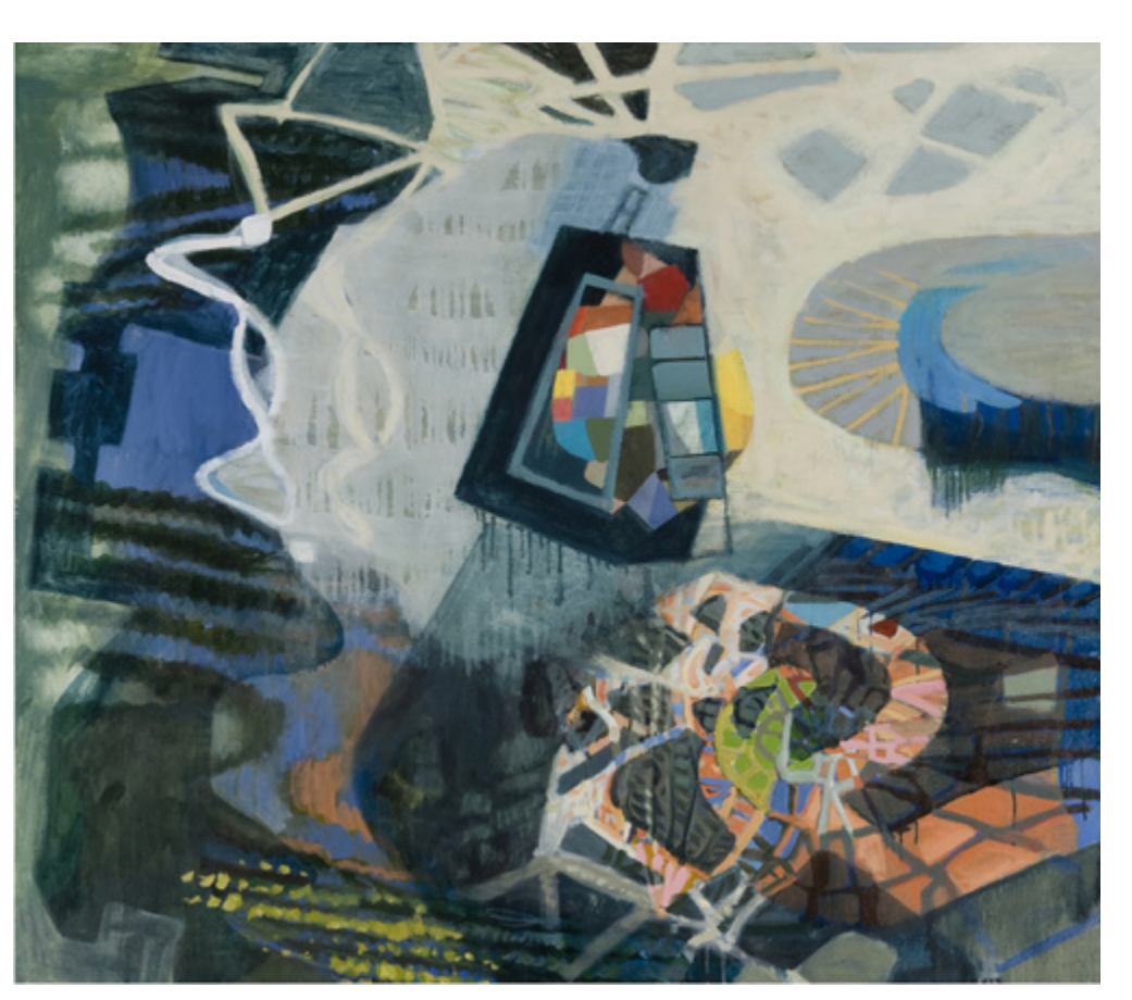
Barbara Grad, Traffic, 2008, oil on linen, 42 x 48", Courtesy of the artist.

Kemper at the Crossroads 33 West 19th Street 816-753-5784 Kansas City Video Villa: New Paintings by Barbara Grad February 4-May 28, 2011