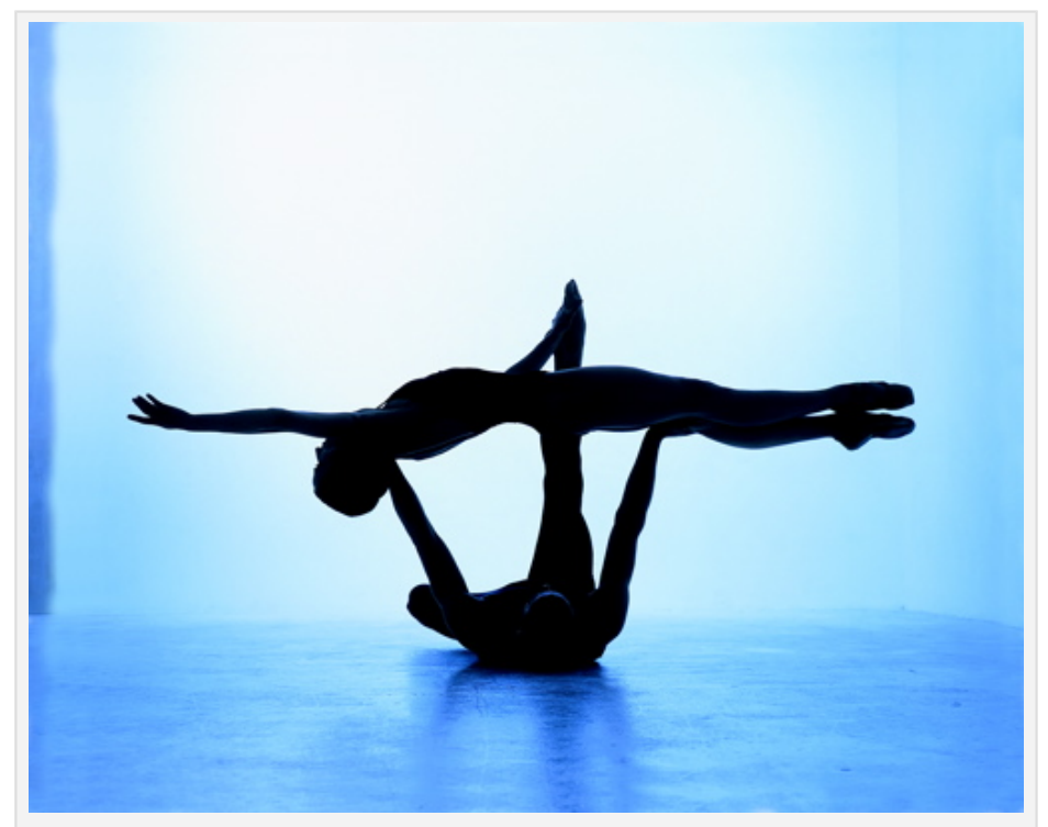
The ArtsKC Fund supports musicians, dancers, and other performing artists and art organizations, in addition to those working in the visual fields. This ballet performance at the Carlsen Center at Johnson County Community College was made possible in part by ArtsKC Fund support.

In 2008, the ArtsKC Fund included 72 companies and met its goal to raise $725,205. The workplace giving campaign between February and April was matched with a $100,000 grant from the Francis Family Foundation and enhanced by a number of high-level ($10,000+) Renaissance Circle and other corporate and local government donations.