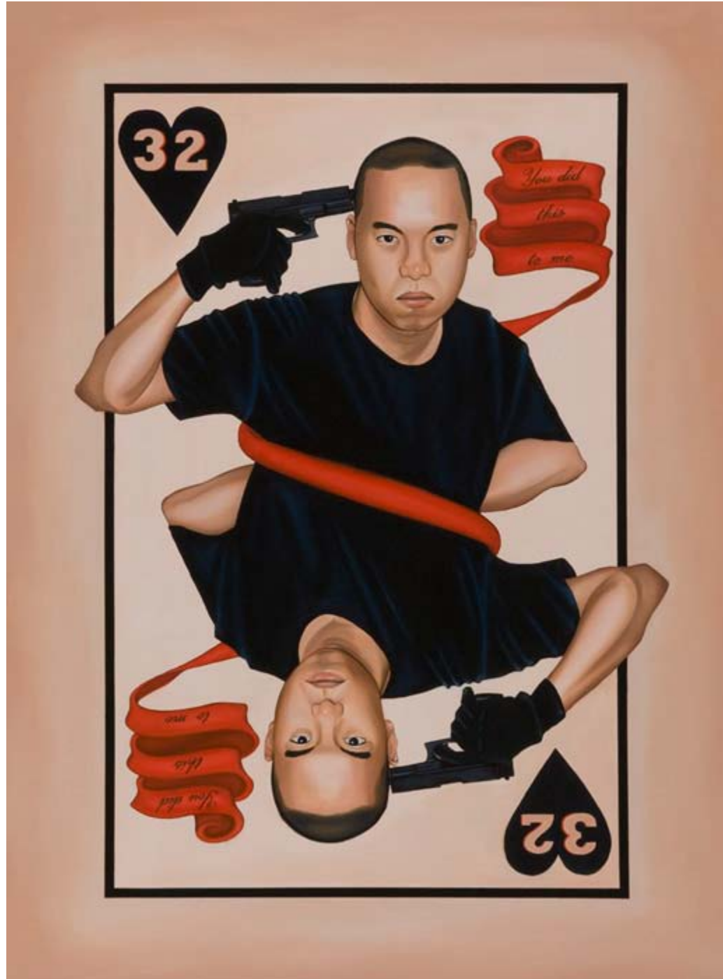
Jay Norton, Suicide King , Oil on Wood, 36 x 48, 2009.