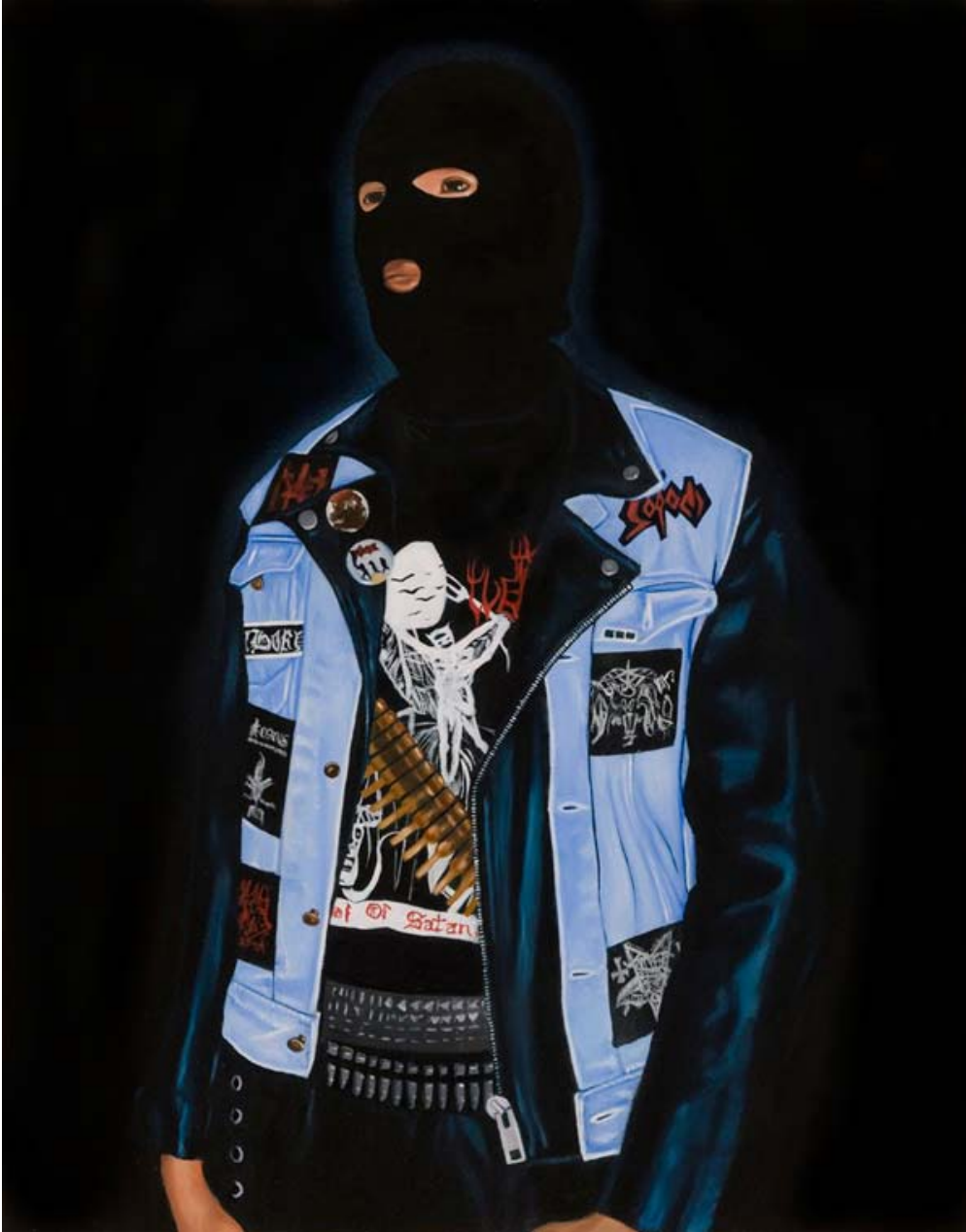
Jay Norton, Filipino Badass , Oil on Panel, 10 x 14, 2010: The heavy metal guy with the face mask on.

Some viewers may tend to be disgusted by Norton's imagery. Is it necessary? Is it important? The answer is yes. Norton is but one in a long line of artists who have sympathetically portrayed the disaffected and even if the images seem T-shirt-ready, on any given weeknight the basic cable lineup broaches "investigative reports" of sociopathic subjects (some in suits and ties holding political office) claiming the "high" ground of journalistic license. On one level, this is entertainment of the most