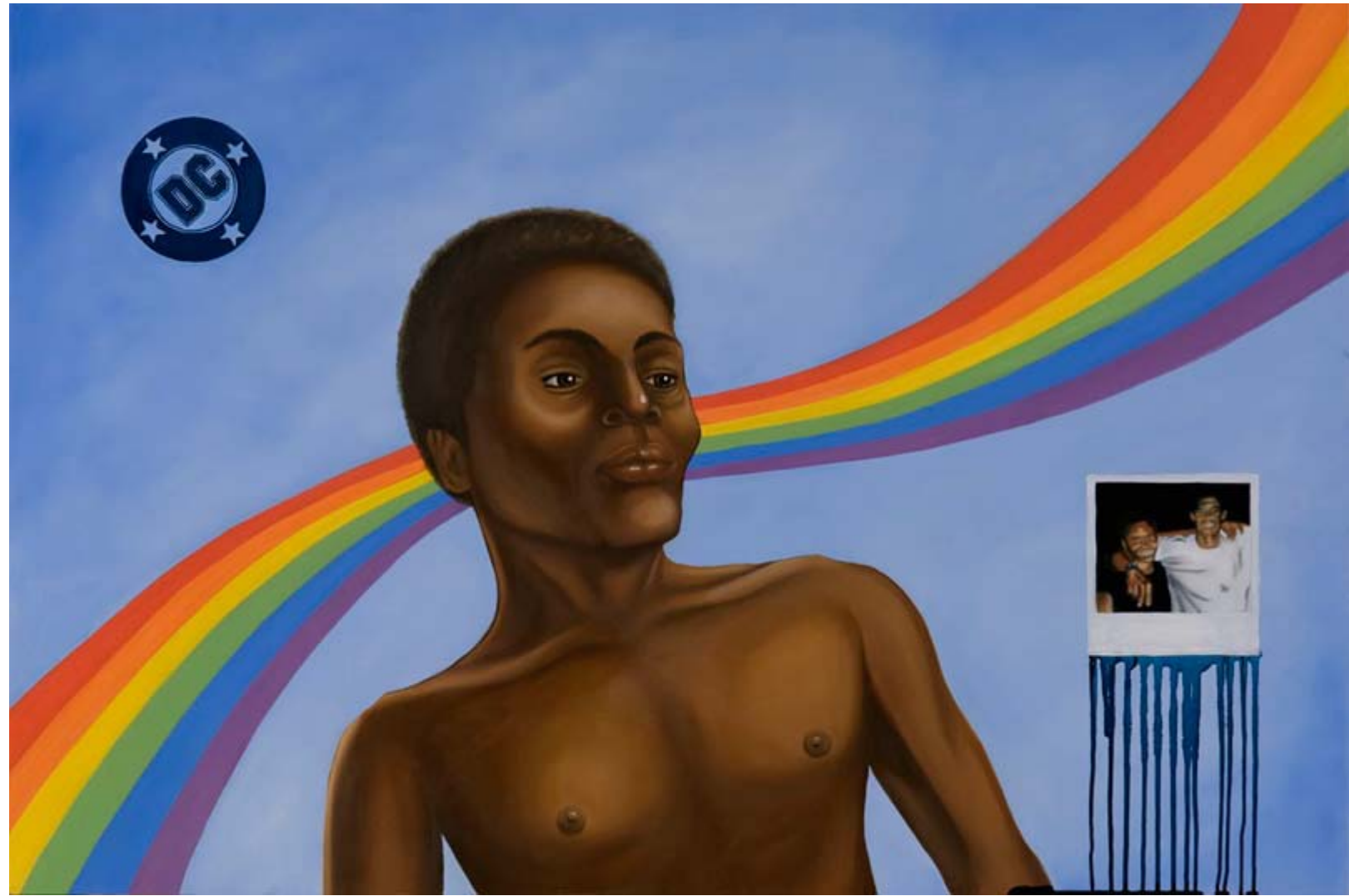
Jay Norton, Black Rainbow , Oil and Pencil on Panel, 20 x 16, 2010.