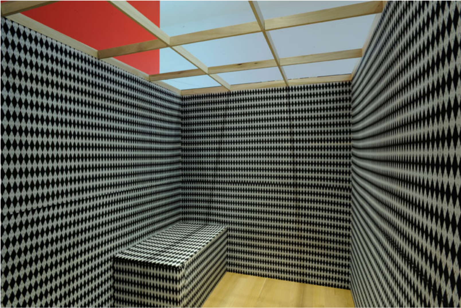
Rashawn Griffin, dumpling, 2012, Mixed media, 87.5 x 107.5 x 84", Courtesy of the Artist.