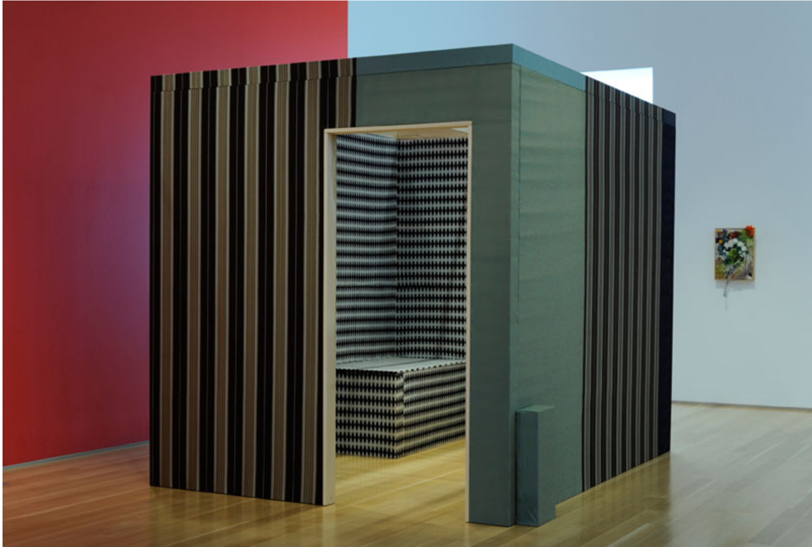
Rashawn Griffin, dumpling, 2012, Mixed media, 87.5 x 107.5 x 84", Courtesy of the Artist.