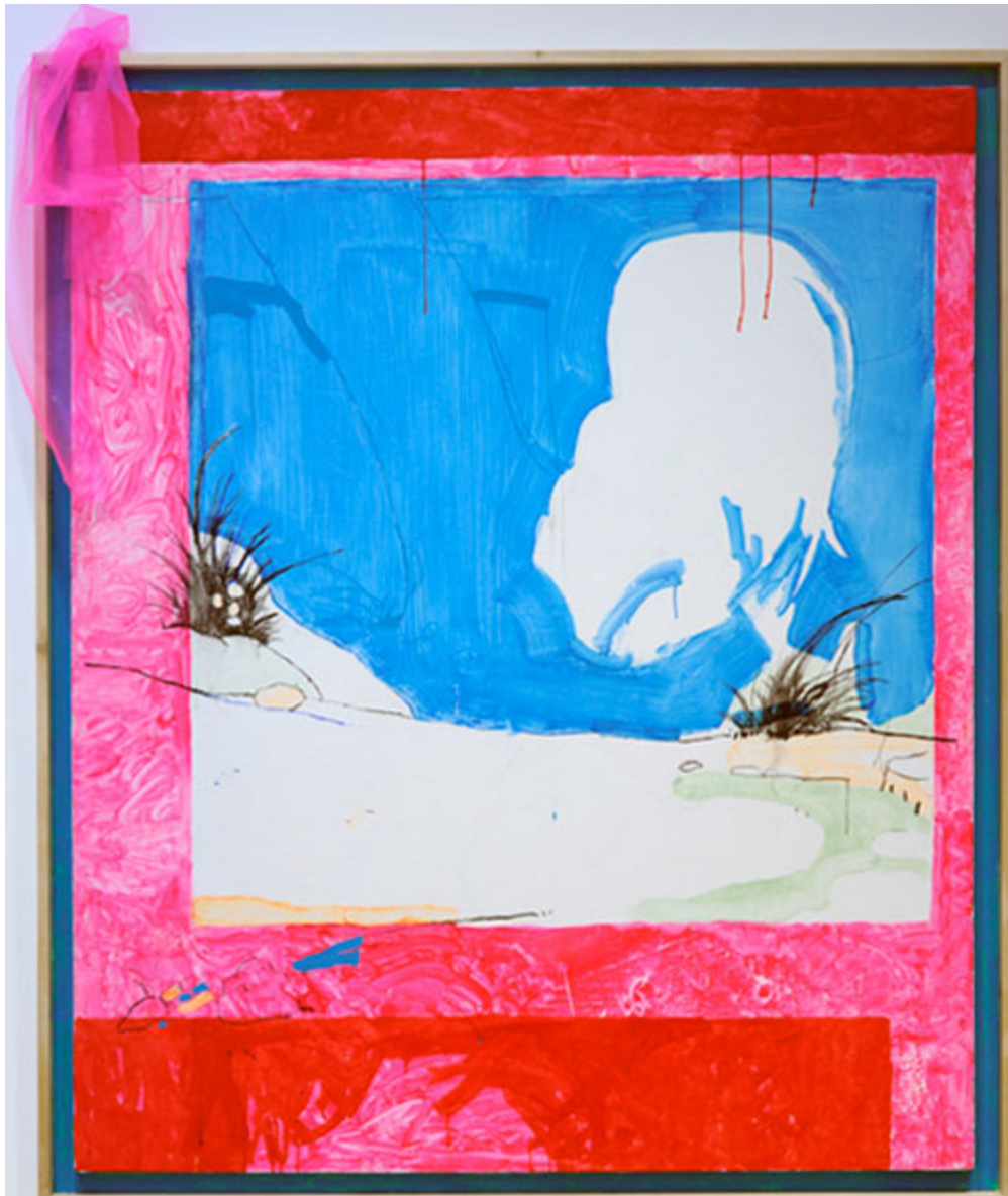
Rashawn Griffin, untitled , 2012, Water soluble oil, ink, acrylic on panel, 77 x 65", Courtesy of the Artist.

Cotter of the New York Times noted "the work doesn't seem to have a particular center, but maybe that's the point." At the Nerman, however, surrounded by other works to allow for a pattern to emerge, it takes root.