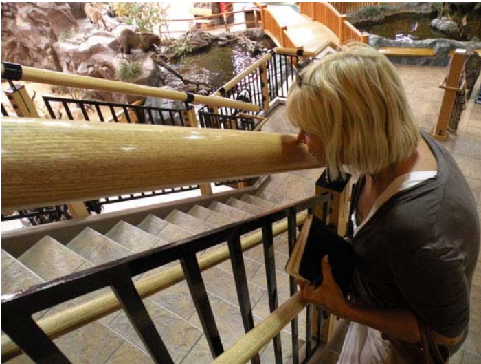
Sissel Tolaas, Smellscape , 2012, Photo Megan Mantia.

This project is not solely predicated on environment. I suspect other determinants such as race, gender and socio-economics will play a part in results as well. Participants can use their other senses as part of this mapping, but it will be their own memorable recollections that set off the primal reactions to ones experience.